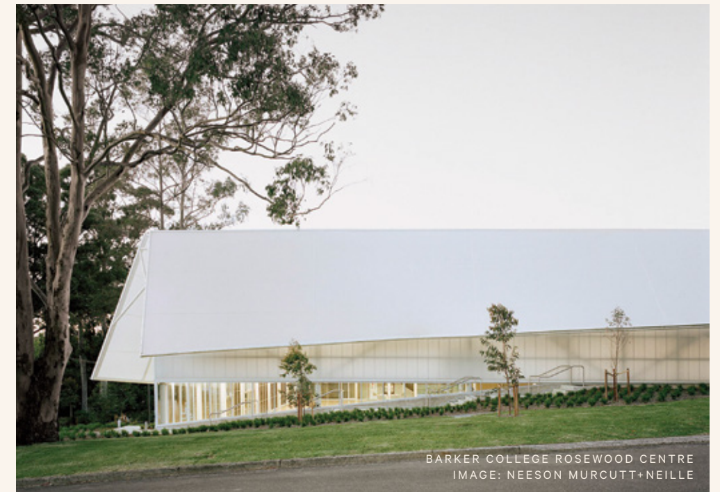
BARKER COLLEGE ROSEWOOD CENTRE

“We know all families are different so we’re sensitive to the nuance of that. We’re conscious of creating spaces where people can enjoy being together, as well as providing the sanctuary and privacy to be apart.”