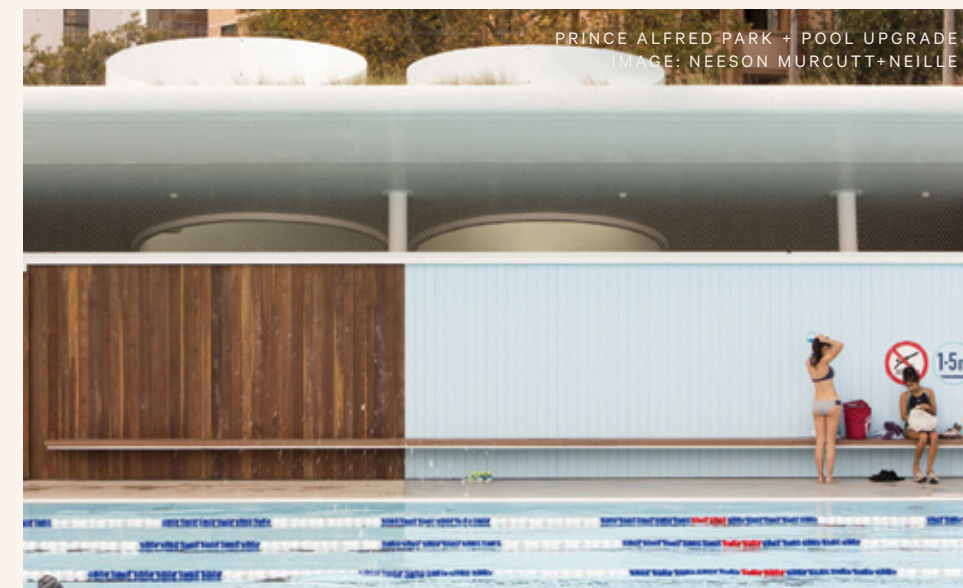
PRINCE ALFRED PARK + POOL UPGRADE

With a history of high-profile clients, including the City of Sydney, the Australian Museum, the Sydney Opera House, NSW National Parks, and the Sydney Olympic Parklands Authority, Neeson Murcutt + Neille’s work has been acclaimed locally and internationally, including the esteemed Robin Boyd Award for the best residential project in Australia.