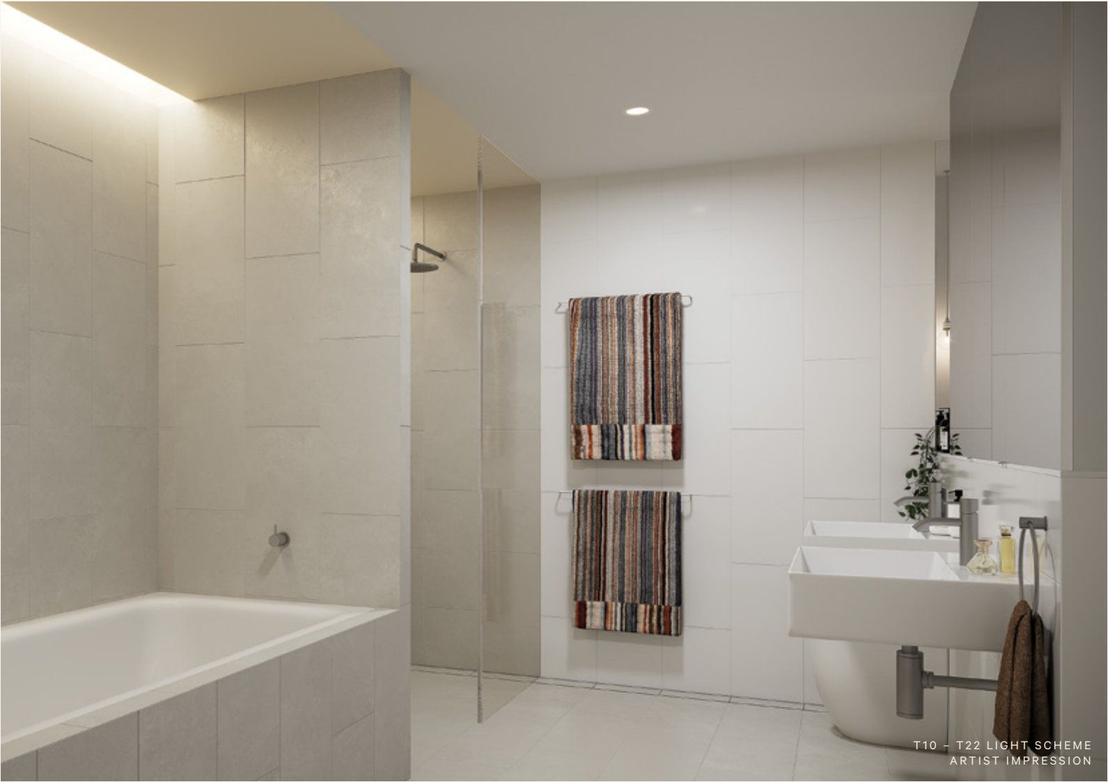
T10 – T22 LIGHT SCHEME ARTIST IMPRESSION

“The shower and bath are housed in such a way that there’s a sense of intimacy; of stepping in and immersing yourself,” says Stephen. “It provides you with a sense of being in a room within a room.”