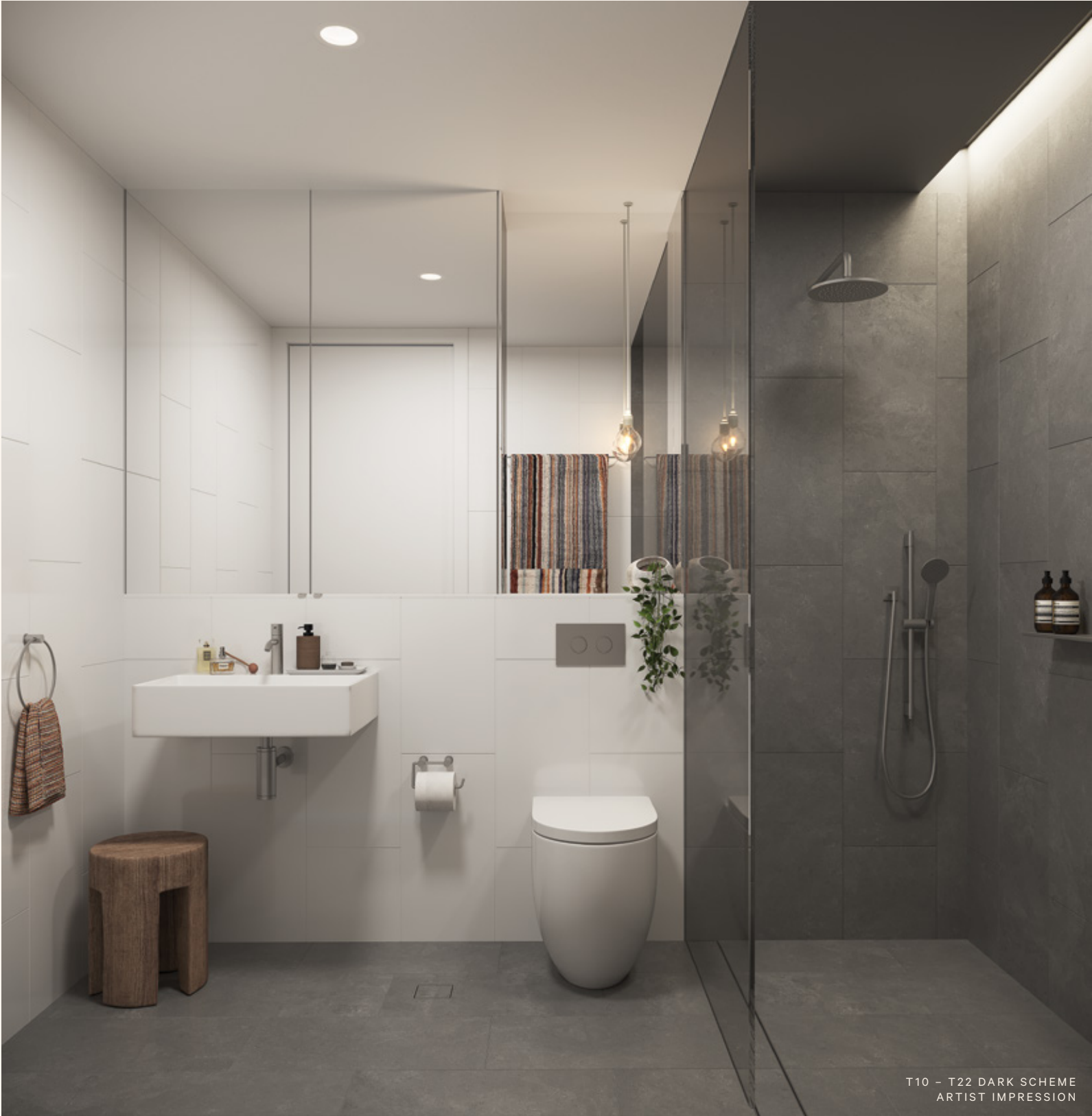
T10 – T22 DARK SCHEME ARTIST IMPRESSION