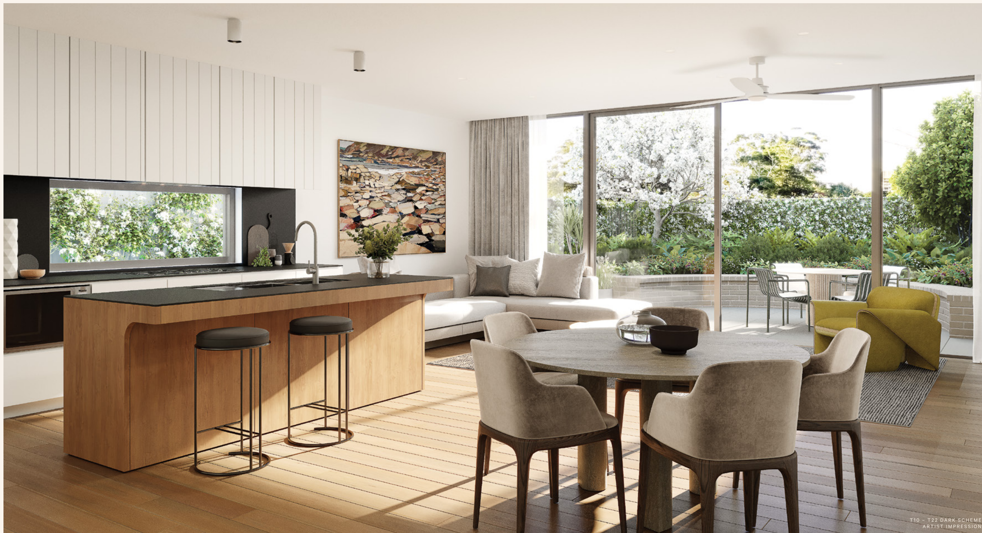
T10 - T22 DARK SCHEME ARTIST IMPRESSION

To enjoy such generosity of width in a room, from the kitchen and living areas, flowing to the open deck within a garden is a rare luxury. Perfect solar orientation brings sunshine in winter and easy shade in summer for a beautiful aspect, all-year-round.