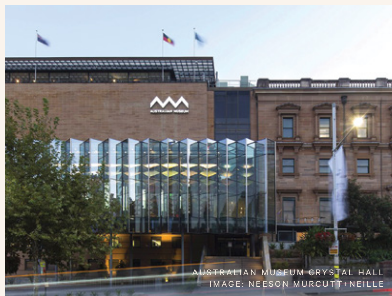
AUSTRALIAN MUSEUM CRYSTAL HALL